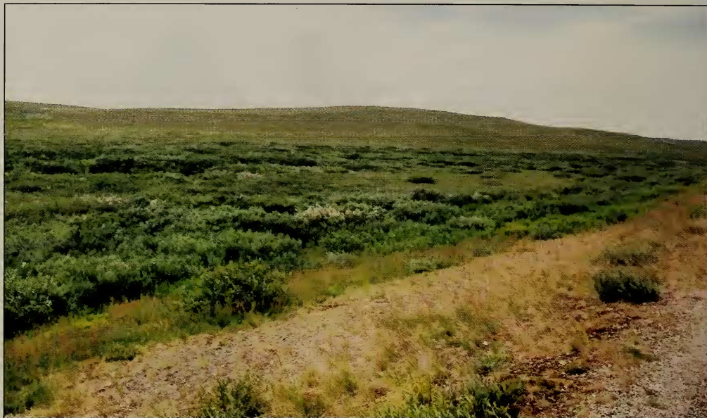
Fig. 5. Type locality of Elachista tanaella sp. n., North Norway, Tana: Faccabæljåkka.

present in ductus bursae near insertion point of ductus seminalis; corpus bursae longer than wide; signum an elongate dentate plate, widest in middle. There is great variation in the length of the apophyses anteriores. In three dissected females the ratios of the length of the apophyses posteriores and the length of the apophyses anteriores are 0.9, 1.6 and 1.9. The ratio for each specimen is the mean value of the ratio of the left and the ratio of the right pair of apophyses. Figs. 3a and 4a show the extremes.